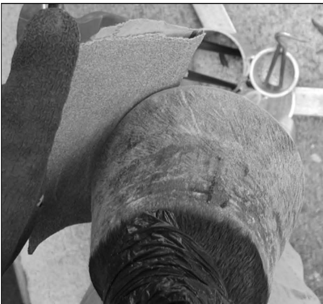
Figure 9c Sand mustang roll to finish [Ref: R/R #14, #15]

To thoroughly simulate natural wear, we must sand the entire outer wall of capsule. I use a medium grade sand paper to do this. This also gives a striking finish to hoof wall. My clients always appreciated this “fine finish” to my hoof work.