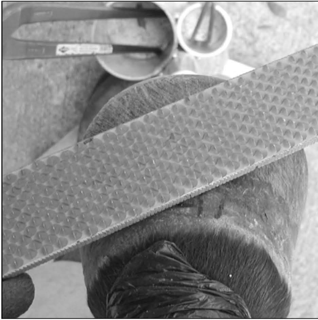
Figure 9a Final Rasping for wall irregularities [Ref: R/R #2, #3, #5]

This is the final opportunity to harmonize any minor protruding wall irregularities just below the healing zone with the natural thickness of hoof wall. Do this with the file size of rasp, taking care not to scrape the coronary band. Removing periople in the healing zone will not cause harm [See Bulletin #110]. Use long, light sweeping swipes of rasp that begin at top of hoof below the coronary band and end at the turn of the mustang roll.