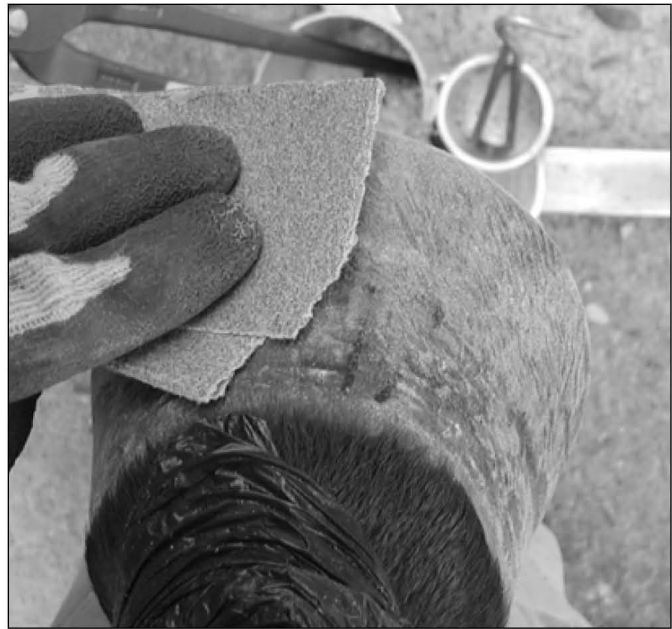
Figure 9b Sand outer wall to finish [Ref: R/R #15]

This is the final opportunity to harmonize any minor protruding wall irregularities just below the healing zone with the natural thickness of hoof wall. Do this with the file size of rasp, taking care not to scrape the coronary band. Removing periople in the healing zone will not cause harm [See Bulletin #110]. Use long, light sweeping swipes of rasp that begin at top of hoof below the coronary band and end at the turn of the mustang roll.